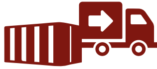
Cargo Container Tracking